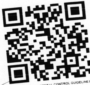
QR CODE FOR PARENTAL CONTROL GUIDELINES

GST No : 32AAECK7994C1ZG HSN/SAC No : 9984